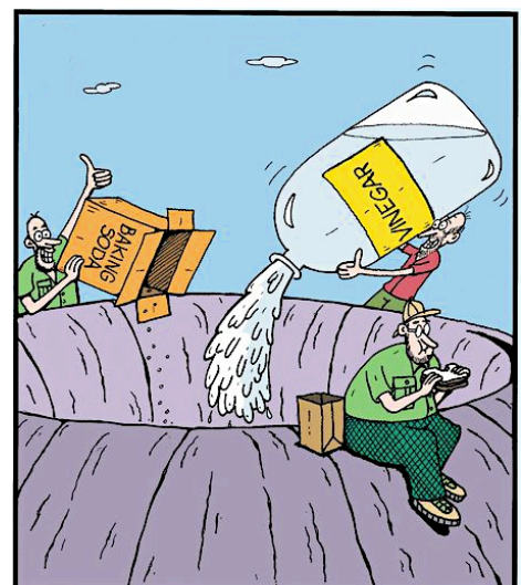
Volcanologist practical jokes